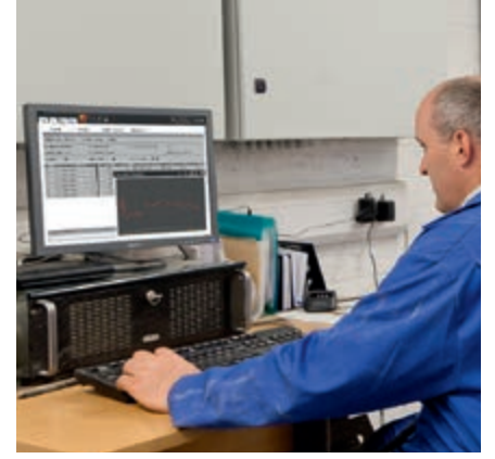
amacs on the farm office PC