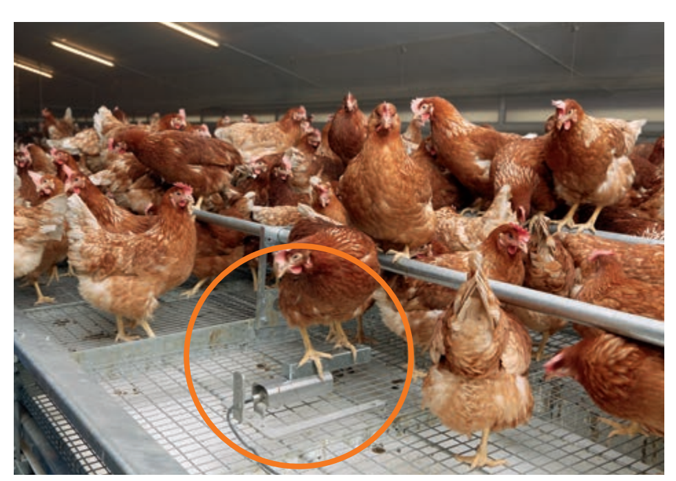
Incas 2 in a layer aviary

ensures a high number of weighings and therefore precise weight determination.