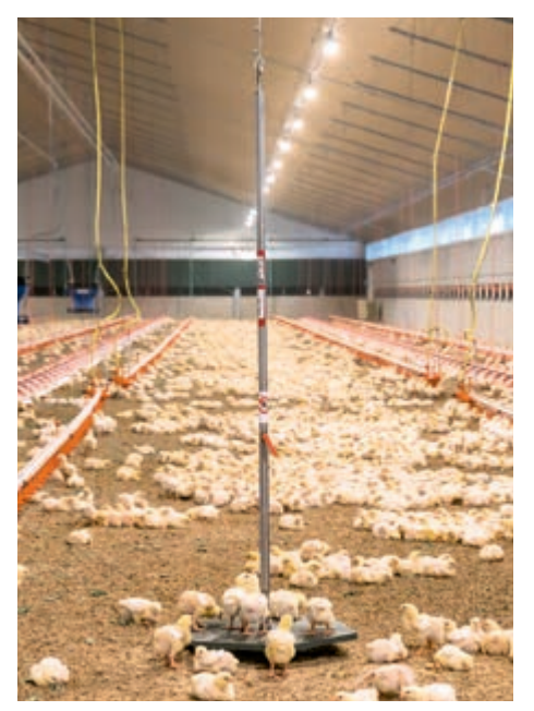
Swing 20 in a broiler house