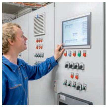
15" touchscreen in the amacs control cabinet

All data can be retrieved via a passwordprotected and encrypted internet connection using the office PC, smartphone or tablet.