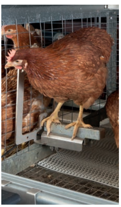
Incas 2 in an enriched colony system