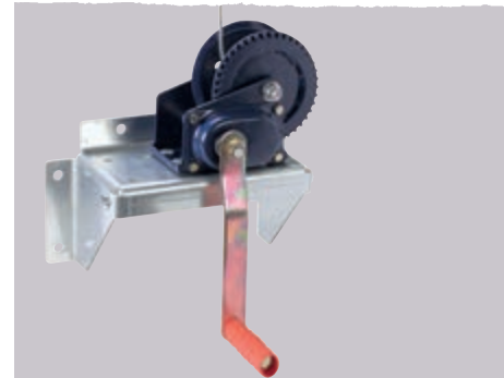
Cable winch for wall suspension