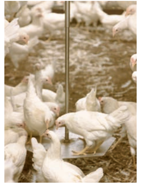
Swing 20 (stainless steel) in a pullet rearing house