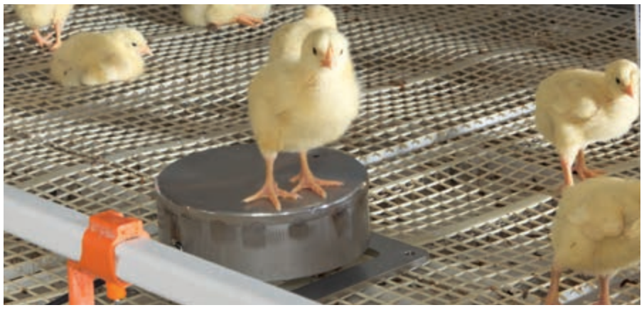
IncasCompact in the AviMax broiler system

IncasCompact are poultry scales ideal for weighing pullets as well as broilers kept in the AviMax system. The scales are made entirely from stainless steel. The circular weighing platform has a diameter of 15 cm. IncasCompact is simply placed on the floor where the two feet hook into the flooring. Thanks to the compact design, the scales can also be used for mobile weighing.