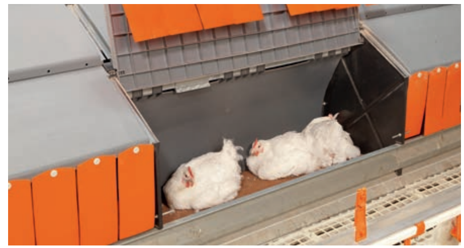
Nesca 2 determines the hens' weight while they visit the nest