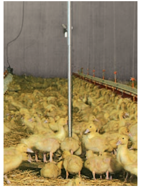
Swing 20 in a house for duck growing