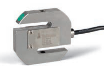
Load cell for Swing 20 and Swing 100

Swing 20 is suspended from the house's ceiling. During the service period, the scales can simply be removed for cleaning while the weighing electronics remain installed close to the ceiling where they are protected against dirt and dust.