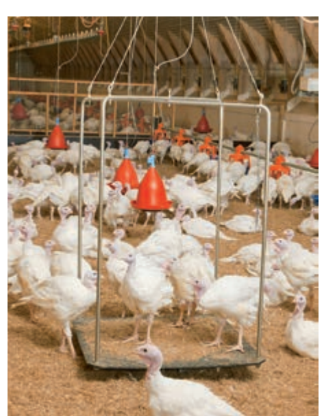
Swing 100 in a house for turkey growing

Swing 100 consists of a 1 x 1 m large plastic plate that is fixed to two stainless steel brackets. Swing 100 is attached directly to the load cell by means of four suspension ropes and snap hooks. The suspension point is high, keeping swinging motions to a minimum to ensure that the birds accept the scales. This guarantees a high number of weighings and therefore precise weight determination. The scales come with a winch so that the height can easily be adjusted according to the birds' size and age. For cleaning with a highpressure washer, the scales can be released from the snap hooks.