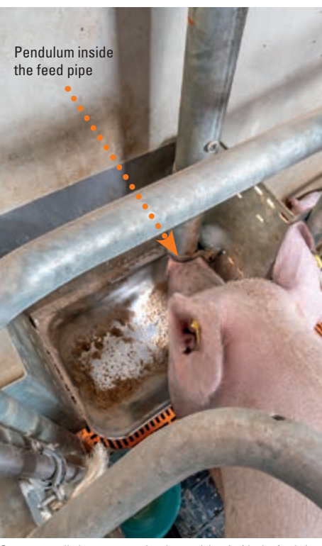
Sensor-controlled: a sow actuating the pendulum inside the feed pipe