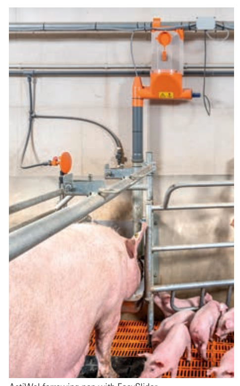
ActiWel farrowing pen with EasySlider

Eating times and feed quantities are predetermined in the BigFarmNet Manager software. Therefore, a sensor is not required.