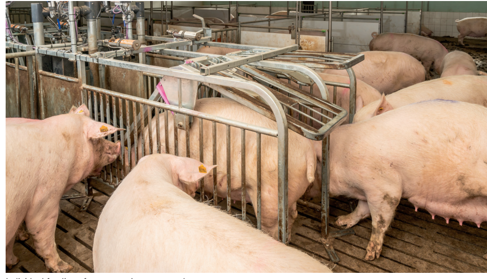
Individual feeding of every sow in a protected space

The 510 pro station controller can control up to ten feeding stations. It is installed directly in the aisle or in the office. With our clever BigFarmNet technology and the mobile app, you can control the feeding system and the ESF stations directly in the barn. Monitoring and managing animal, feeding, climate and other data is of course also possible, even