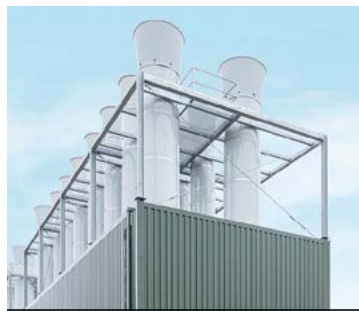
Ventilation, heating, cooling