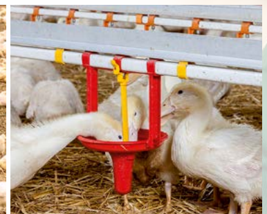
Water consumption of ducks