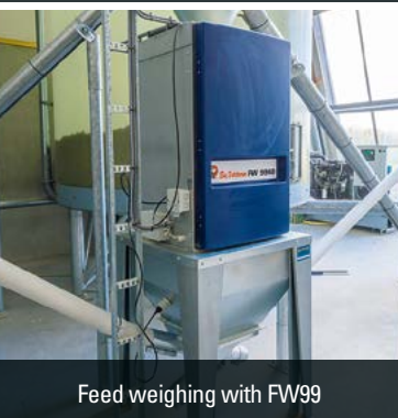
Feed weighing with FW99