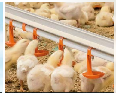
Water consumption of broilers