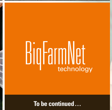
To be continued ...