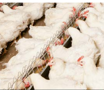
Feed consumption of broiler breeders