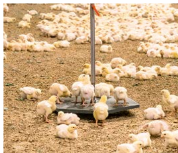
Bird weighing with SWING 20