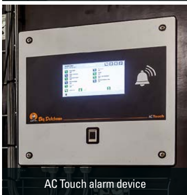
AC Touch alarm device