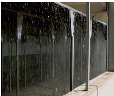
Exhaust air washers