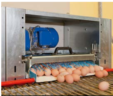
Egg collection for broiler breeders