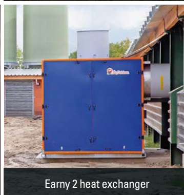
Earny 2 heat exchanger