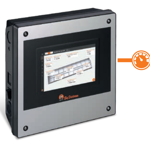
The 310pro climate computer with its 10-inch display works together with the three-way heating control to ensure a constant temperature level

The 307 pro and 310 pro climate computers regulate the entire house climate, including the stepless three-way control of the hot water heaters from 0 to 100 %. The pigs thus do not have to be subjected to fluctuating temperatures, an important benefit maximising growth.