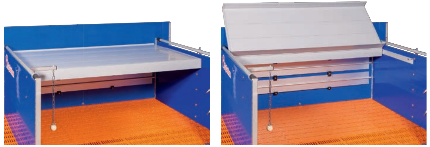
Plastic flooring with only 10 % slatted area is used beneath the covering plate; Twin pipes ensure optimal temperatures in the piglets' resting area

of warm air. The heating system (Twin pipe) is installed directly below the cover. The main purpose of this system is to heat the resting area of the piglets. Temperatures can be lower in the rest of the pen, allowing a significant reduction of overall heating costs.