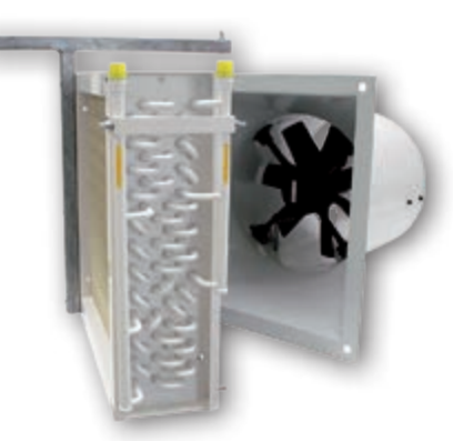
The built-in fan distributes the warm air ideally

* Please observe national occupational safety and health regulations when using this coupling.