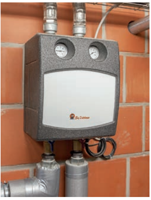
Three-way heating control