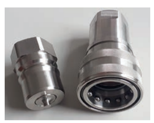
Automatic quick coupling