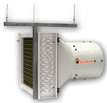
HeatMaster – high energy efficiency thanks to its aerodynamic shape

The practical quick couplings for HeatMaster allow for very flexible use in different compartments.