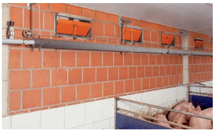
Aluminium fin heater as a full-space heating system - ideal in combination with CL 1200 fresh air inlets