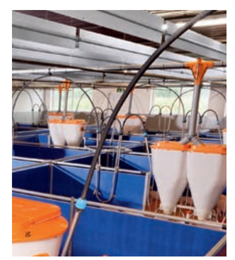
Twin pipe - less dust on pipes