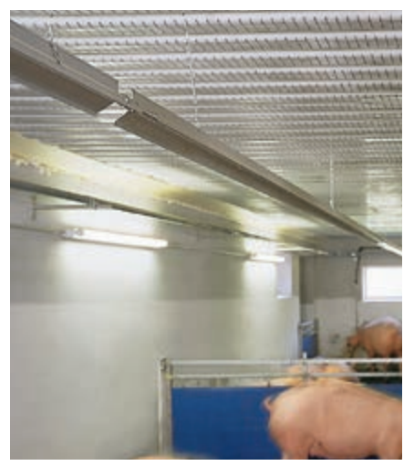
Delta pipe - ideal for installation below the DiffAir ceiling

Delta and Twin pipes are especially wellsuited for perforated air channels and DiffAir ceilings. They are made of aluminium and are operated with hot water, of which they require only a limited amount, however. Thanks to their good thermal conductivity (heat output of 180-200 watts/m) they ensure constant room temperatures inside the barn. These heating systems can also be used for pre-heating in the central aisle. The pipes are anodised for better protection against ammonia. They are of comparatively low weight and can be delivered in different sizes up to a length of 6 m. The pipes are easy to assemble.