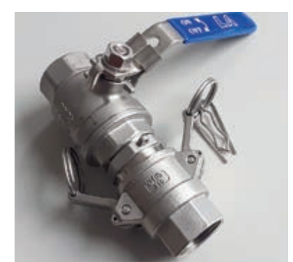
Manual quick coupling

when the female part is removed. Hot water therefore cannot escape.