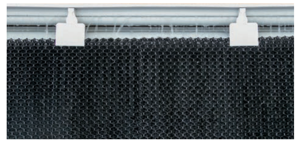
Top profile with perforated pipe and deflector for an even distribution of water on the pads