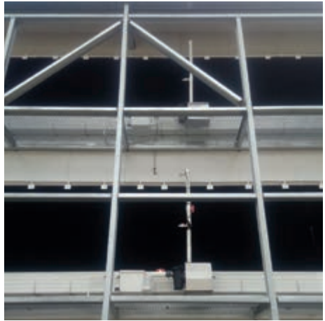
Double RainMaker for high cage houses