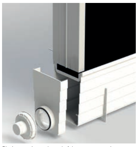
Rinsing opening at the end of the water reservoir