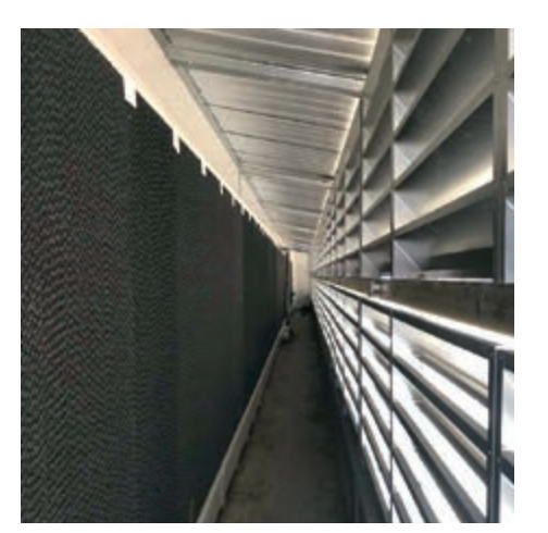
Protection of RainMaker against direct sunlight