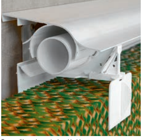
Top profile and practical pad holders