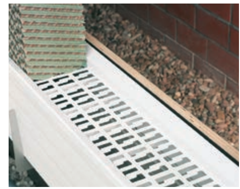
Water reservoir for up to 48 litres per running metre

The supply unit facilitates maintenance tasks since it provides easy access to the float valve. The rinsing opening of the water reservoir makes it easier to clean the reservoir.