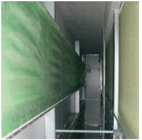
Tunnel inlet with roller curtain

RainMaker with plastic pads in combination with ViperTouch ensures ideal temperatures inside the barn thanks to the precise control.