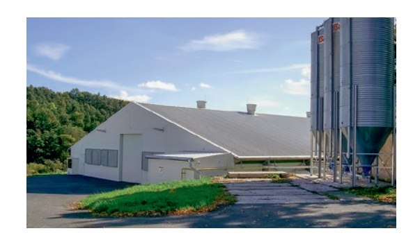
Western Bohemia, Czech Republic Broiler production