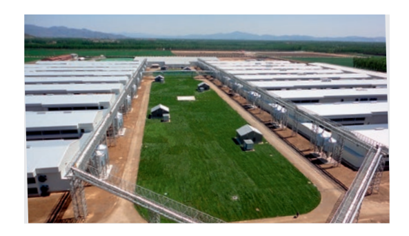
Beijing, China Layer and rearing farm