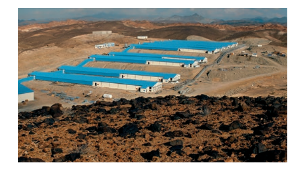
Dubai, United Arab Emirates Layer and rearing farm