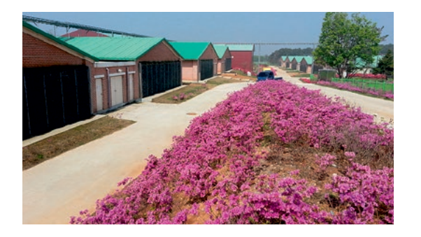
Nonsan-si, South Korea Sow management