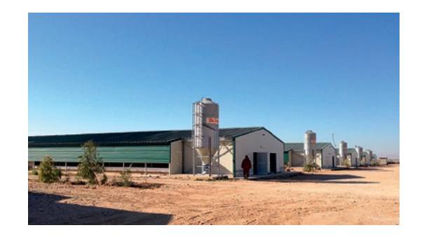
Biskra, Algeria Broiler production and broiler breeder management