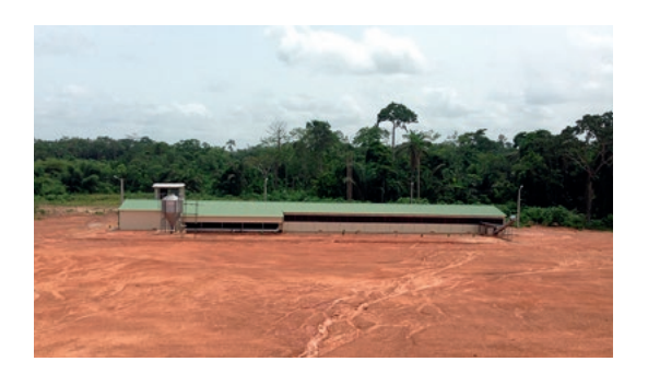
Abidjan, Côte d'Ivoire Egg production