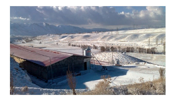
Firuz Kuh, Iran Broiler production