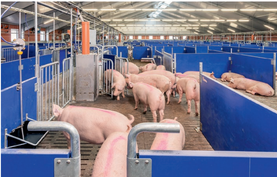
View of a waiting area equipped with the computer-controlled ESF station Call-Inn pro

A separate leaflet provides more detailed information.