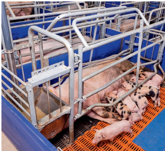
4-foot crate with cast iron slat beneath the sow