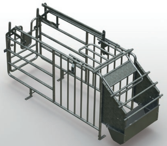
Stall closed: The sow has easy access to the trough