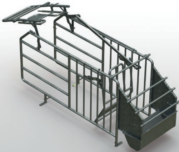
Free-access stall “BD” open: The sow enters the stall and closes it by herself

When the sow enters the open stall, the door locks behind her and opens again as soon as she wants to leave the stall. The stall cannot be opened from the outside by other sows.