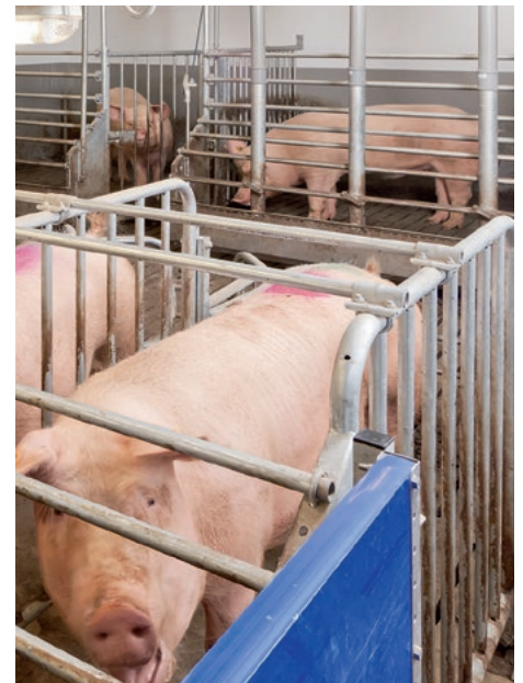
Service centre with separate boar pen