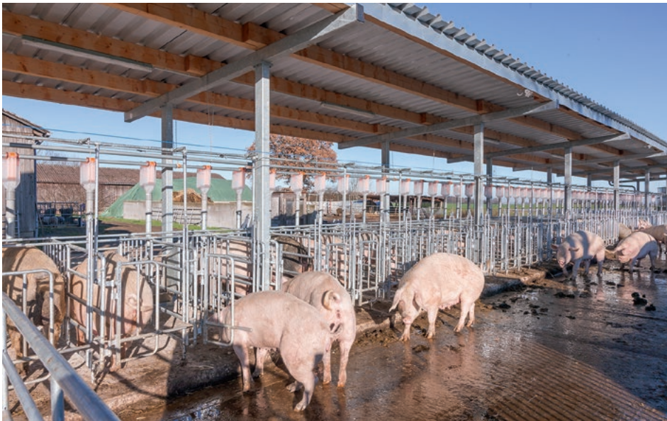
Free-access stall "Easy Lock" – the sow enters and leaves the stall through a swinging door