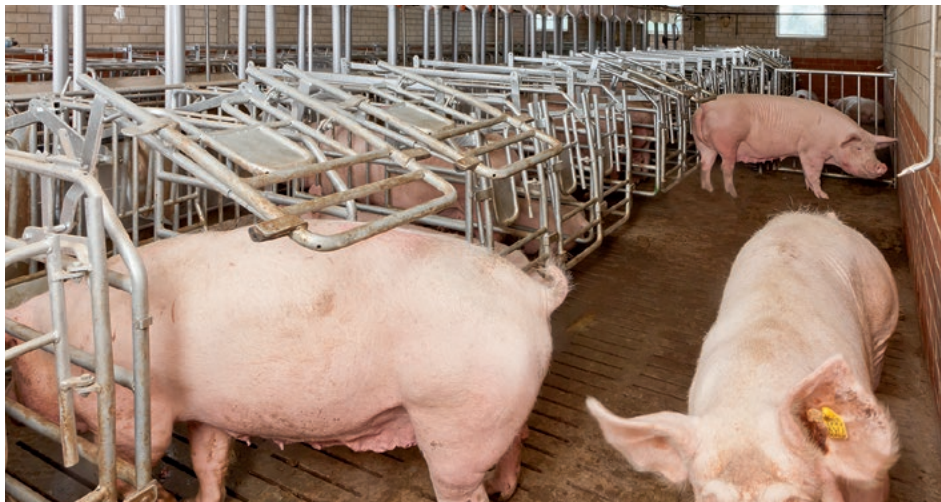
View of a waiting area with free-access stall “BD”