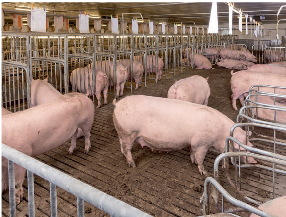
View into a waiting area with single stalls