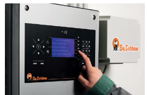
CallMatic pro station computer in the aisle

makes for better accessibility (animal-free area) so that adjustments are easily possible.