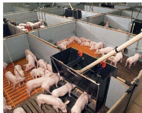
Group pen with MultiPorc

If the DryRapid dry feeding system is used, the Big Dutchman automatic feeders are most appropriate.