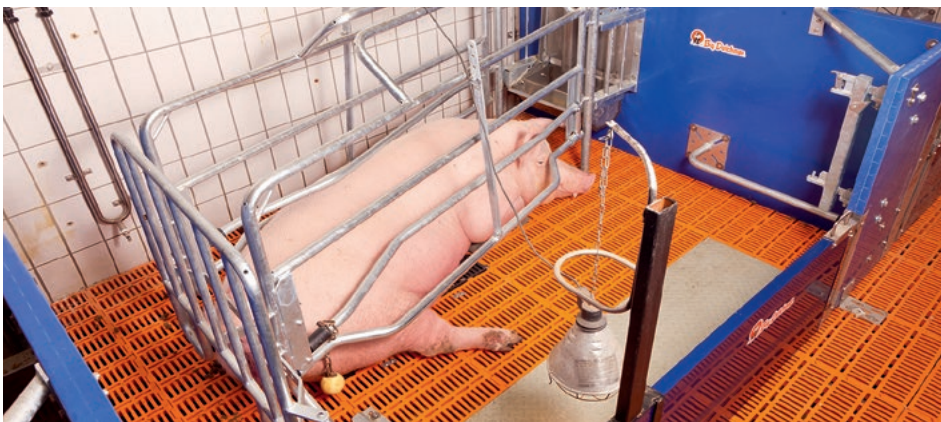
BD free-movement pen with maternity bed → more freedom of movement for the sow

farm staff to remain up-to-date with the farrowing and ensure the piglets' protection. The maternity bed is opened after farrowing to provide ample room of movement for the sow.