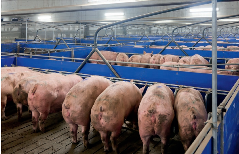
View into a waiting area with group pens and liquid feeding system