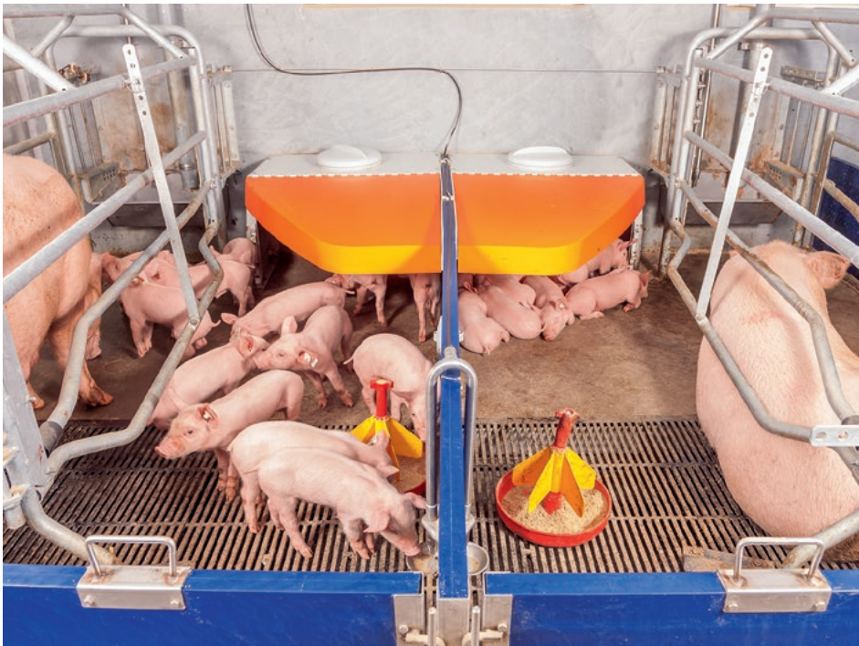
4-foot crate with cast iron slat beneath the sow and integrated, heated piglet nest

There is a special cover available for the piglets. The front part of the cover can be opened to facilitate monitoring. The rear part has an opening which can be used for a heat lamp or closed off with a sealing cap when the lamp is no longer required.