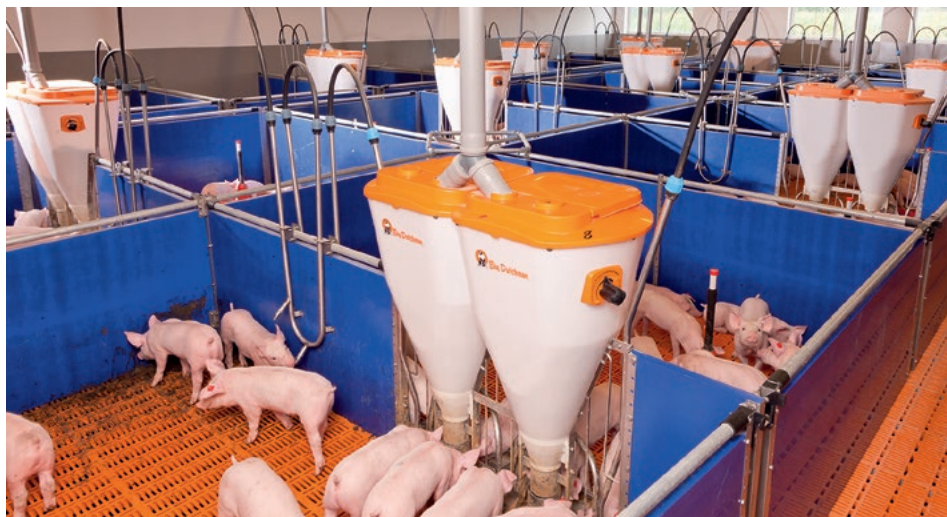
Piglet rearing pen with PigNic Jumbo

either electrically or by hot water. The penning system consists of flexibly usable, dimension-independent plastic partitions. Door fittings and pen posts are made of stainless steel. Feed for the piglets can be supplied either in dry or liquid form.