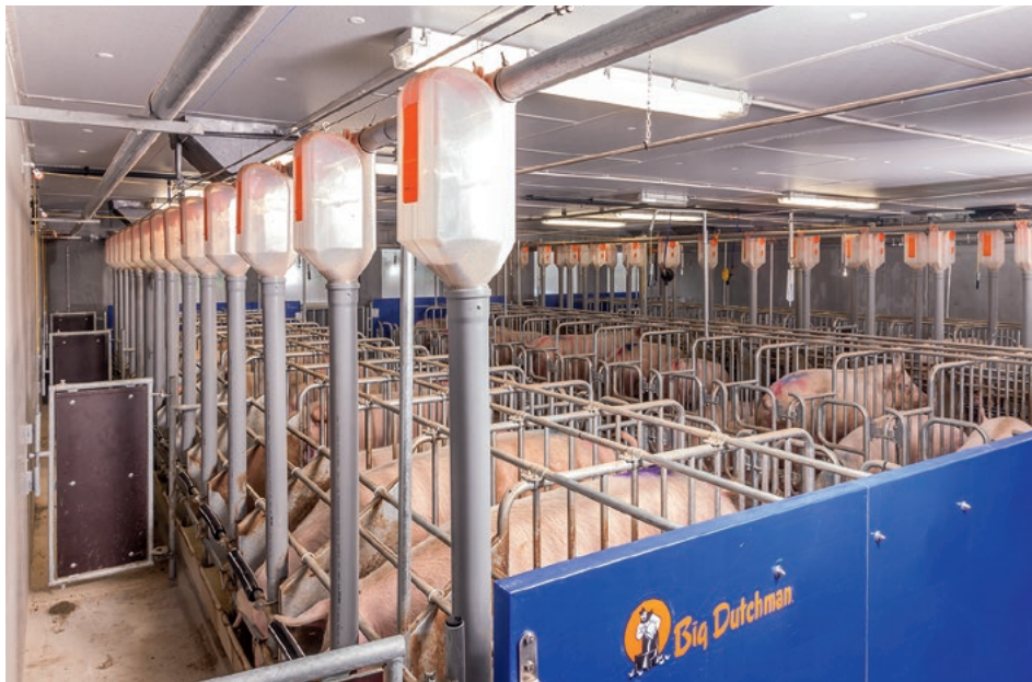
Service centre with stalls and boar-restraining doors

fortably and controlled individually. There is no aggression during feeding. Artificial insemination can easily be carried out.