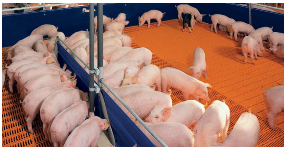
Piglet rearing pen with the liquid feeding system HydroAir

If the piglets are to be fed with liquid feed, our HydroAir and HydroMix Sensor liquid feeding systems are the best feeding systems to use.