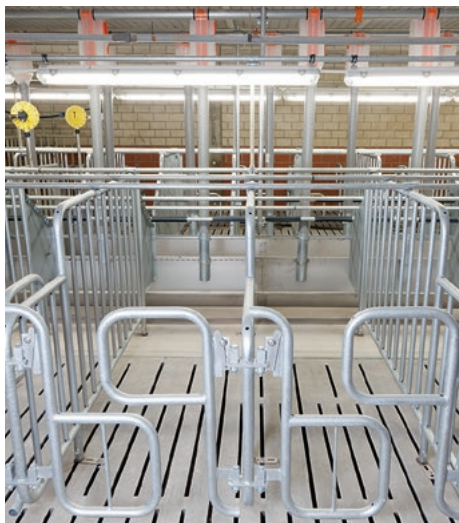
Stall with P-door for trouble-free insemination