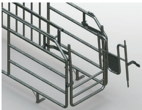
Integrated insemination door