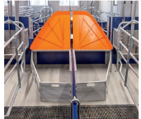
Piglet nest cover

There is a special cover available for the piglets. The front part of the cover can be opened to facilitate monitoring. The rear part has an opening which can be used for a heat lamp or closed off with a sealing cap when the lamp is no longer required.