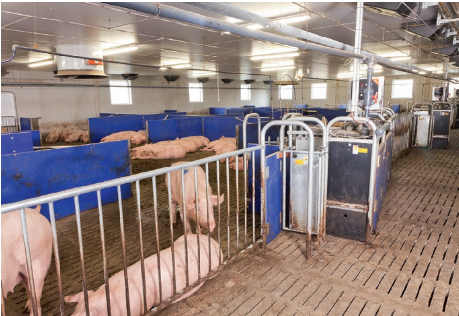
View of a waiting area equipped with the computer-controlled ESF station CallMaticpro