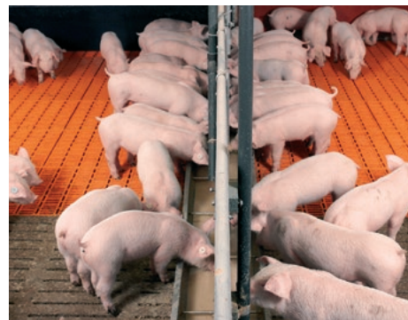
Piglet rearing pen with HydroMix Sensor

If the piglets are to be fed with liquid feed, our HydroAir and HydroMix Sensor liquid feeding systems are the best feeding systems to use.