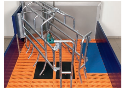
Diagonal self-supporting farrowing crate

The plastic flooring ensures good manure penetration and does not have any sharp corners or edges. It can be cleaned easily and can be combined with solid plates, cast iron slats and heating plates for the piglets. Depending on the housing concept, the crates can be arranged straight or diagonally.