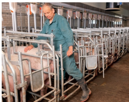
Easy access to the pig