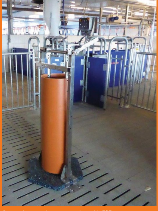
Rooter for sows in pen gestation with ESF.