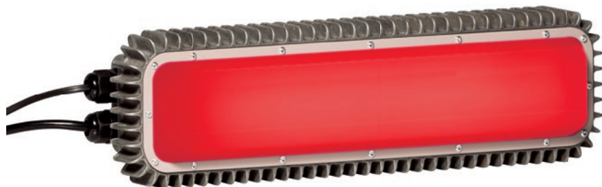
Red light with diffuser and ingress protection rating IP 67