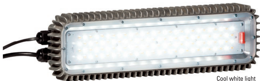
Cool white light

technology and a wide optical spectrum. Energy savings of up to 50 percent compared to conventional moisture-proof lamps are an unbeatable advantage.