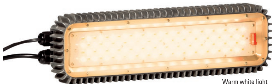
Warm white light