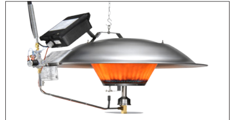
Solaire™ Infrared gas brooder