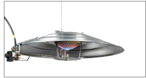
Solaire™ single-jet brooder

The DSI box is made with industrial plastic, and is sealed for protection from the harsh environment, and for thorough washdown