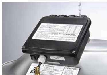
Easy / thorough washdown

The Solaire™ brooders have stainless steel components for superior corrosion resistance