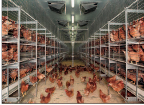
Laying phase: the system is open

sizes up to 176 birds, ensuring the nests are evenly used right from the start. The system can be fully opened after the familiarization phase, allowing the hens to act out their natural behaviors of scratching, pecking and dust bathing. Note: the pullets should have already been reared in an aviary-type system, which is an important condition for a good start into the laying phase, and reduces stress when the birds are moved in.