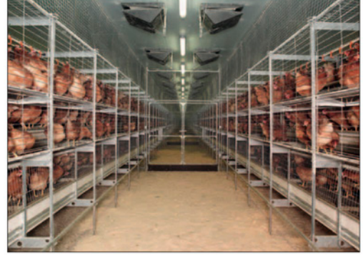
Familiarization phase: the system remains locked

A partition installed every 7.9' makes for manageable group