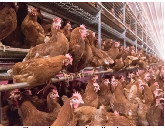
The pre-located perches allow for easy access for the hens

Large openings provide easy access to the scratching area.