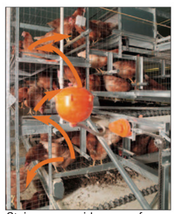
Stairways provide access for the hens to all levels

sizes up to 176 birds, ensuring the nests are evenly used right from the start. The system can be fully opened after the familiarization phase, allowing the hens to act out their natural behaviors of scratching, pecking and dust bathing. Note: the pullets should have already been reared in an aviary-type system, which is an important condition for a good start into the laying phase, and reduces stress when the birds are moved in.