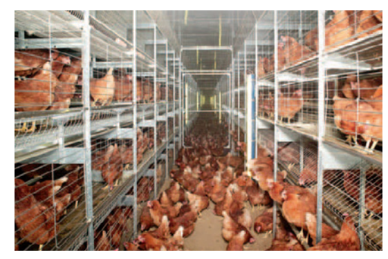
NATURA70: The rows are arranged in the same direction in the house, at the left side you see the longitudinal egg belt, and at the right side the large entry openings

The NATURA70 can also be used as an aviary with free range area