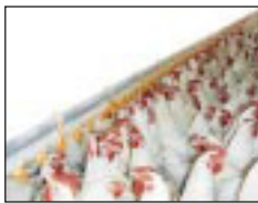
Nipple watering system