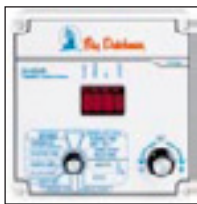
Digital control units