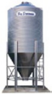
Bulk feed silo